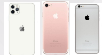
I-PHONE (6 OR ABOVE)

Double Beam Splitter With C-Mount for I-Phone Attachment for Slit Lamp Medix Double Beam Splitter Model»DBS-MS For Slit Lamp with (80/20) & (50/50) Option Superior German Optics. Excellent Work with Many Models of Zeiss, Topcon, Takagi. Medix C Mount(I-Phone Attachment) Model»MCA-IP For I-Phone Attachment (Mobile-optional) With Superior German Optics. (Before Order, Please Specify Camera Details).