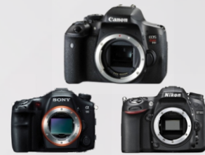
DSLR CAMERA (CANON/NIKON/SONY)

Double Beam Splitter With C-Mount for Dslr Camera for Slit Lamp Medix Double Beam Splitter Model»DBS-MS For Slit Lamp with (80/20) & (50/50) Option Superior German Optics. Excellent Work with Many Models of Zeiss, Topcon, Takagi. Medix C Mount(Camera Attachment) Model»CA-DSLR For Dslr Camera-Sony/Nikon/Canon(optional) With Superior German Optics. (Before Order, Please Specify Camera Details).