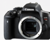
DSLR CAMERA - CANNON

Integrated Beam Splitter and DSLR Camera Adapte for Slit Lamp Medix Integrated Beam Splitter and DSLR Camera Adapter for Slite Lamps Model»DBS-MS For CANON Dslr Camera Superior German Optics. Excellent Work with Many Models of Topcon, Takagi.(Before Order, Please Specify Camera Details).