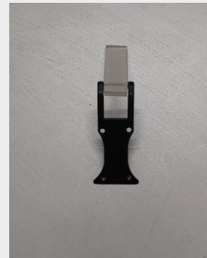
1. HS Type Slit Lamp